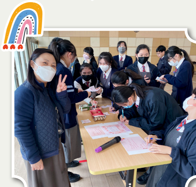
Ms Fok is thrilled to see students' active participation.