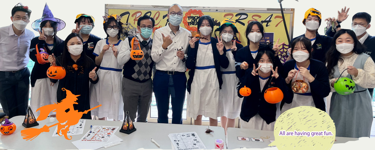
All are having great fun.