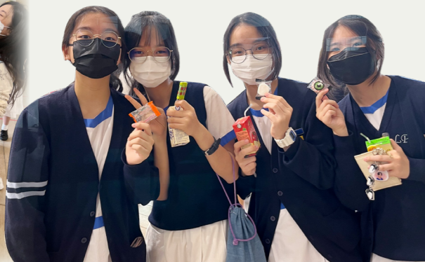
Students earn these delicious treats as prizes.